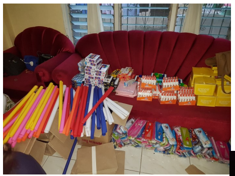
This is a glimpse of what happens when you sponsor a child. Without you this would not be possible. Thank you so much for your generosity and your love.

We have added another 20 children to the school sponsorship program this year, taking us to 2014 children in total. Made up of 20 children in India and 194 children in 4 different cities in the Philippines. Thank you to all supporters as none of this would be possible without each and everyone of you. We had a great privilege to be apart of the purchasing of the school uniform and all the school supplies this year. It was an enormous job that takes days to complete. After spending hours and hours in the shops the teams would go home and put all the requirements for each child together ready to hand them out to each child. All different sizes and shapes, all different requirements for what ever grade they are in. We sat in ore as we helped and watched the process take place in the different cities. Thank you to all the volunteers in each town to see this all come together is amazing. Well done team Destiny