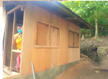
Cerilo and Myrna Taliwala (below)